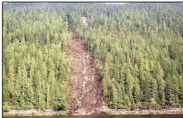
Landslide caused by heli-logging on Gribbell Island. More logging will add to the cumulative effects on the vulnerable Kermode population.

The risk was emphasized in October when a large tugboat towing an empty fuel barge hit a reef near Bella Bella. The tug sank and leaked over 100,000 litres of diesel fuel into the ocean. Attempts to contain the fuel during high storm weather were largely ineffective, resulting in extensive contamination to the adjacent marine environment and a valuable food harvesting area for crabs and clams for the Heiltsuk First Nation. Dead wildlife were