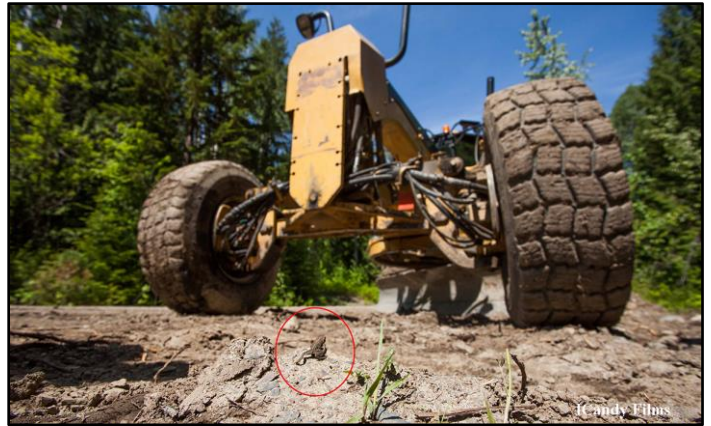
Tiny toadlet (shown in circle at bottom of photo) squares off with huge machine.

By mid-April, thousands of toadlets began appearing on the lower stretches of the logging road within 2 km of Summit Lake as they migrated from the lake to their future homes in the forest. In mid-May, without any notification, NACFOR began grading the road with complete disregard to the masses of toadlets present, killing many. Contrary to all public commitments NACFOR had made to only log in the winter, it brought in a feller-buncher and grapple-skidder to start logging a cutblock.