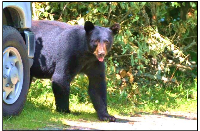
One of New Denver's resident black bears.

For many Slocan Valley residents and other British Columbians who spend considerable time and funding to bear-proof their own properties in compliance with the Wildlife Act, 2016 again proved to be a very frustrating experience as bears accessed easily available foods on neighboring properties where attractants had not been removed in violation of the law.