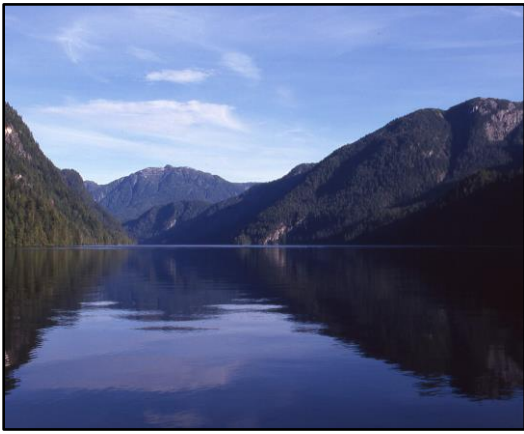
Isolated from the Inside Passage by a reversing tidal river, we hope Green Lake and valley will be protected as a legislated Tribal Park.

when they announced protection of the Great Bear Rain-forest agreement in February. They did, however, encourage coastal First Nations to end the hunt by raising their own