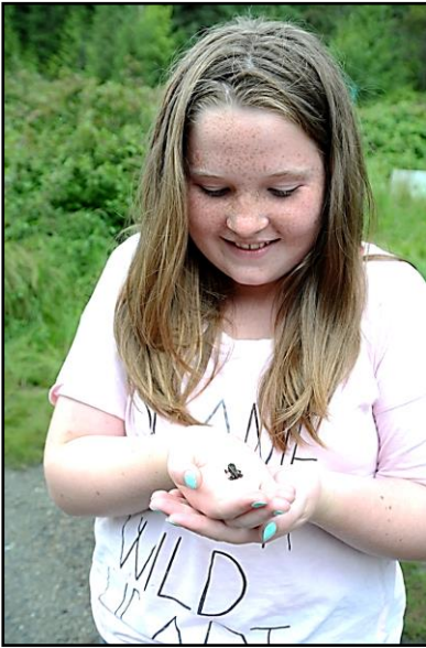
Public education on toad conservation, including school classes, are an integral part of VWS western toad conservation program at Fish Lake.

MoTI gave VWS a permit to construct an experimental temporary toadlet migration deflection fence. This successfully re-directed tens of thousands of migrating toadlets away from their normal and often fatal migration across the highway to a riparian underpass built under a nearby highway bridge. More work will be done to improve this design next year.