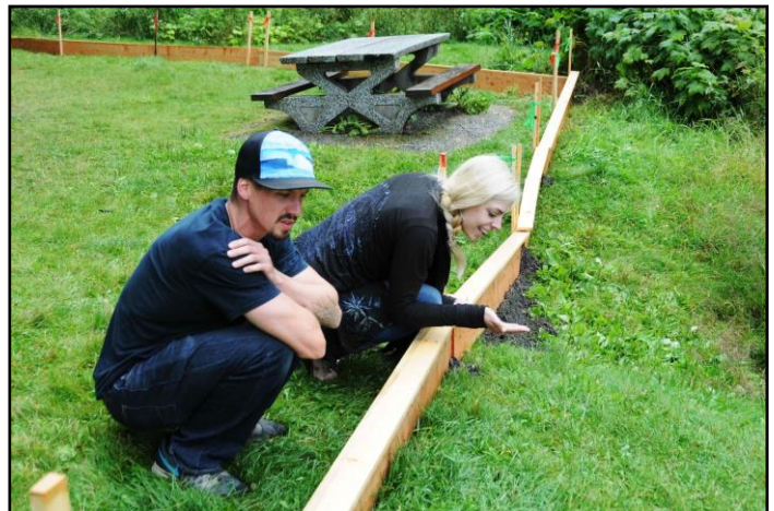
Tourists watching migrating toadlets using directional fence at Fish Lake Rest Stop.

All three annual migrations were found to sustain considerable mortality from vehicles on Highway 31A. This poses a serious long-term conservation risk. VWS researchers found an average of 2-3 adult toads per night killed on the highway. Although researchers helped hundreds of migrating adults off the highway, the loss of even one pregnant female carrying 12,000 eggs is significant. While many toadlets don't migrate across the highway, three highway crossing areas were mapped where thousands of toadlets are killed crossing at a peak time of day for tourism traffic. VWS organized a number of sessions to "bucket" toadlets across the highway, and people with children just came on their own to bucket toadlets.