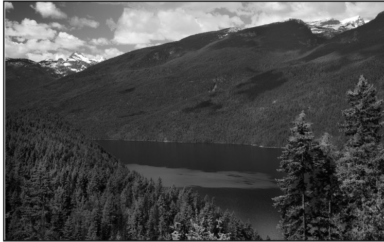
Across the lake, a large parcel of forest in the middle of the photo, along the lakeshore, is the Valhalla Mile. Now it is protected forever.

The Society is not set up to hold private land or to raise funds for private land acquisition. However, several years ago, some Valhalla directors set up a separate organization, the Valhalla Foundation for Ecology and Social Justice (VF),