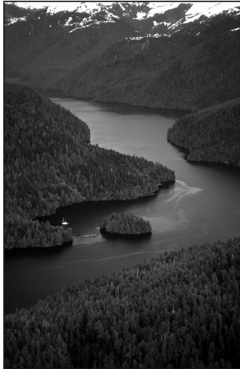
The Green Inlet has had some light logging since the Great Bear Rainforest decision, but it remains mostly pristine, a priceless and irreplaceable gem in BC's coastal ecosystems.

cussions with First Nations on protection of Gribbell Island and the Green Inlet and Valley. He also did field assessments of logging on Pooley Island, documenting the destruction of bear dens and the high grading of old-growth cedar.