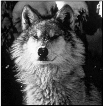
Tracy Brooks - USFWS