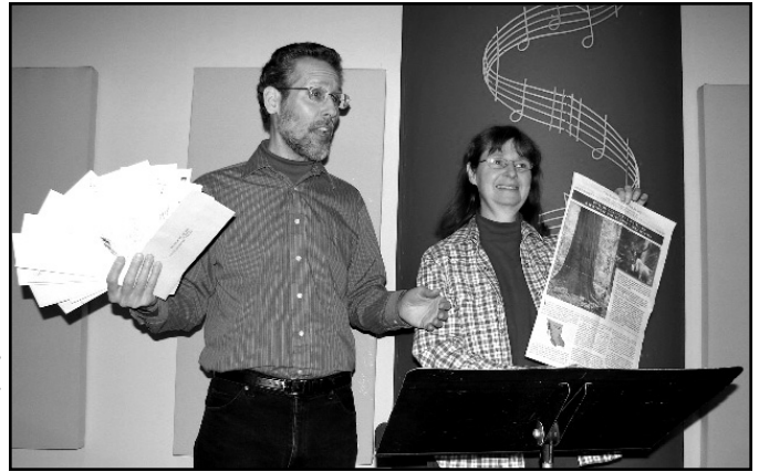
An evening of music with friends resulted in a handsome donation for the Valhalla Wilderness Society.