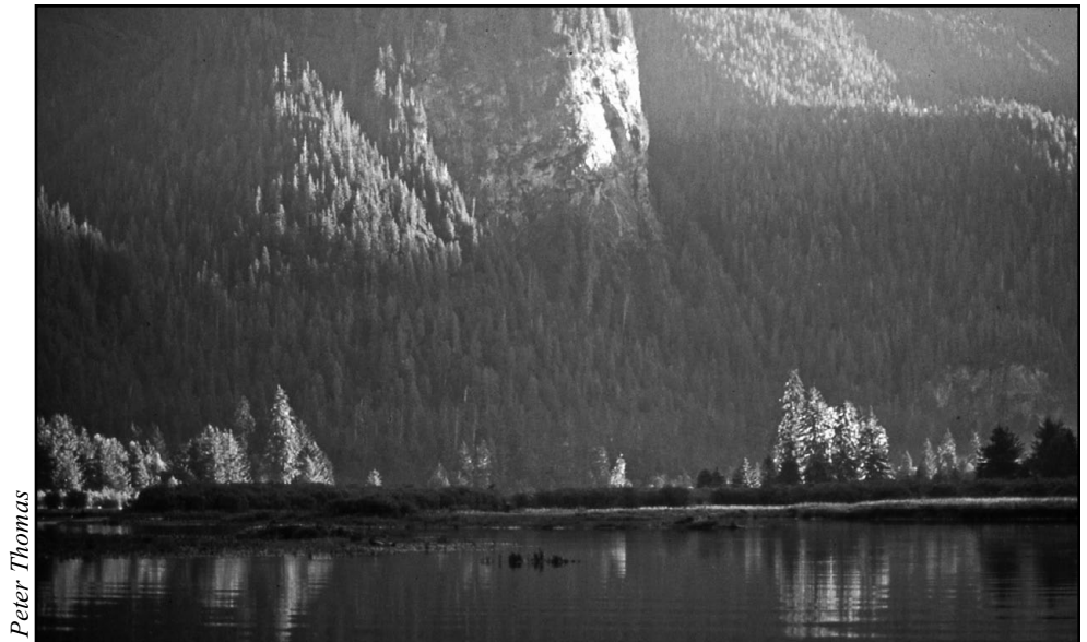
An atmosphere of splendour enwraps the Kutzeymateen Grizzly Sanctuary.

VWS will have input into the new conservancy management plans, and contribute to a planning process for the several new grizzly bear no-hunting reserves slated for the coast. The Society will continue to work for further protection, especially the main valley of Green Inlet, which has one of the biggest sur-