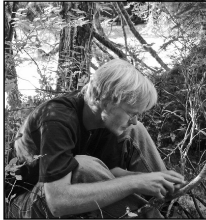
Botanist Toby Spribille in the Incomappleux

What's so good about lichens? Well, the mountain caribou are totally dependent upon them for food. Many other species are linked to lichens, such as the lichen moth. And lichens play an important role in the growth of trees in rainforests. Perhaps what is equally important are the functions we don't know. The inventory being carried out by the scientists is the first key to answering these questions.